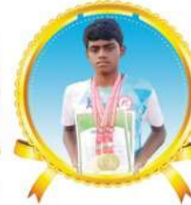
MK. SURYA IX - STD. SWIMMING STATE 4 TH PRIZE